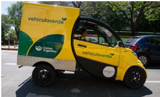
Figure 25. Pilot of Correo Argentino

Main results: The e-minivans were two months in operation, delivering 6,6 packages per hour in an average travel distance of 6,5 km per hour. The load capacity increased compared to the previous vehicles used, improving the logistics operation while reducing emissions.