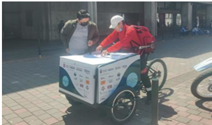
Figure 24. Pilot in Quito.