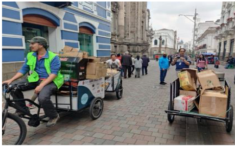
Figure 23. Pilot in Quito.

Main results: The use of e-cargo bikes allowed increase the number of packages delivered in a 100% while improving the monthly income in 25% and reducing the working hours in a 56%.