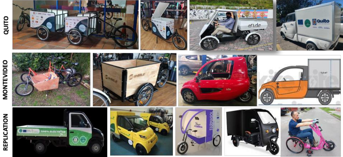
Figure 18. LEVs funded by SOLUTIONSplus in Latin America

In Latin America, SOLUTIONSplus funded the creation of 15 different LEVs, tested in logistics and passenger transport in cities like Quito and Montevideo. Despite positive outcomes, regulatory barriers were identified as challenges to broader LEV adoption.