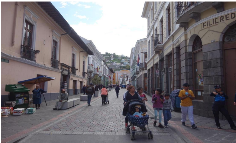
Figure 15. Pedestrian area Historic Center of Quito, Ecuador.

Superblocks, like those in Barcelona, prioritize people over cars, enhancing urban health and coexistence. These interventions are part of broader efforts to redefine mobility, reduce vehicular pollution, and promote sustainable transport.